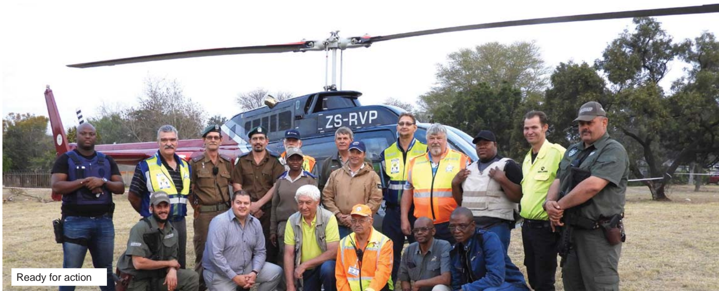
Ready for action