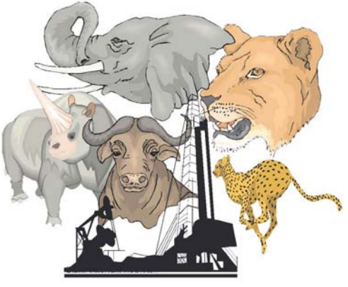
Bojanala Platinum District Municipality www.bojanala.gov.za

Message to the Community: Dear community members, I would like you to take hands with us, the Bojanala Platinum District Municipality, and help us build a better future for all! That includes demonstrating leadership in every aspect of your life e.g. reporting crime etc.