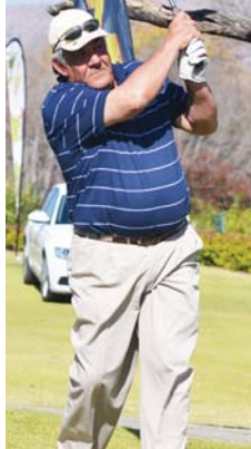
Mnr Frik Du Preez – oud Springbok rugby speler.