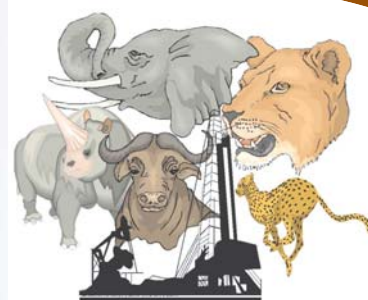
Bojanala Platinum District Municipality