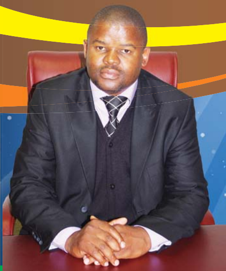
Cllr. Louis Diremelo, Mayor of the Bojanala Platinum District Municipality