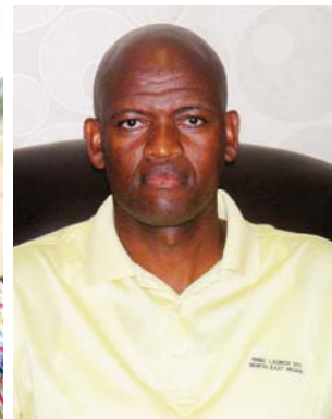
MMC Khunou IDP Monitoring & Evaluation BPDM