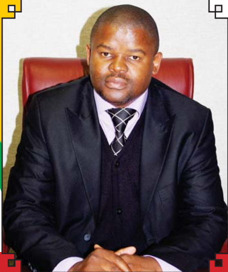
Cllr. Louis Diremelo, Executive Mayor of the Bojanala Platinum District Municipality