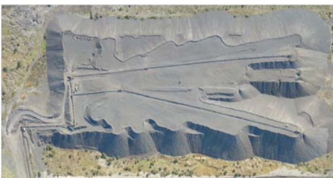
Figure 1: Photo of the current slag storage area

Slag produced as a byproduct in the ferrochrome process is processed utilising Metal Extraction Plants. The processed slag is dumped on a slag stockpile (See figure 1).