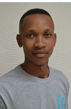
Otshela PO Mechanical Engineering