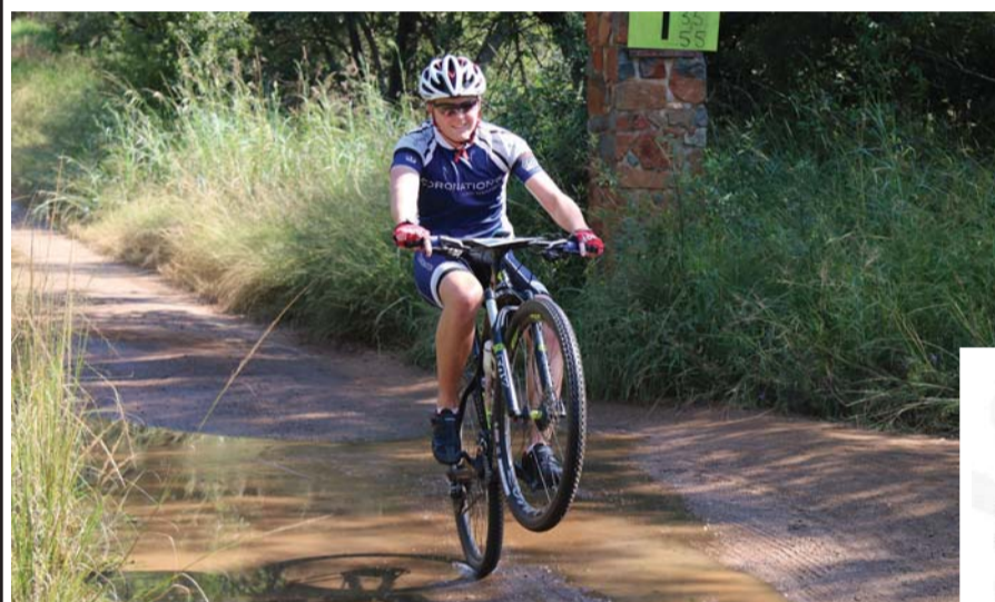
Great fun for young and old!