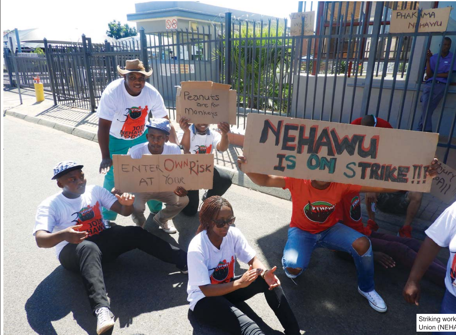
Striking workers of National Education Health Allied Workers Union (NEHAWU) outside Unisa's Rustenburg campus.

Rustenburg – Lecturers and administration staff of Unisa's Rustenburg campus took to the streets on Wednesday, 17 January, demanding that their voices be heard by campus management.