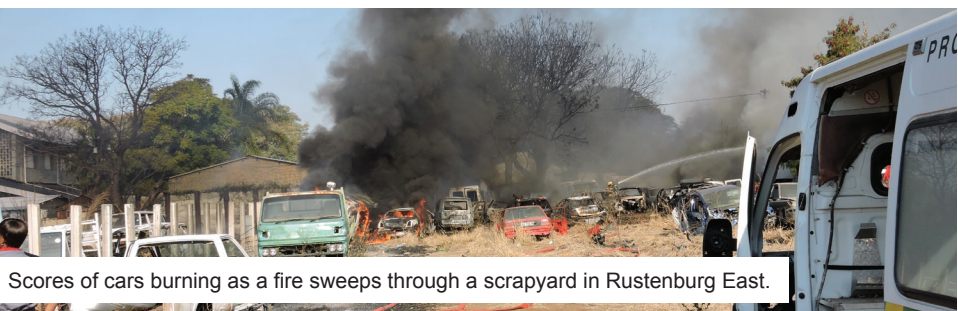
Scores of cars burning as a fire sweeps through a scrapyard in Rustenburg East.

grass which spread to the cars. I tried to fight the men off, but they overpowered me. They then ran away.” As Platinum Weekly spoke to the guard, people ran for cover as a number of vehicles exploded sending dark clouds of smoke into the sky. The fire devoured everything on its path. Police spokesperson sergeant Ofentse Mokgadi on Wednesday 8 August confirmed: “It appears that there was no arson docket registered.”