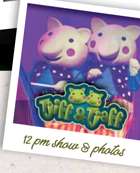
12 pm show & photos