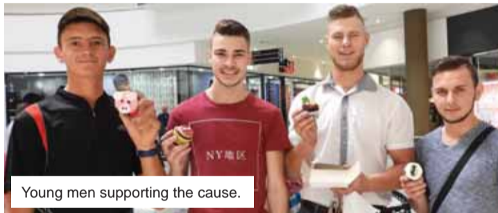
Young men supporting the cause.