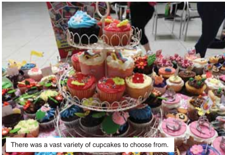
There was a vast variety of cupcakes to choose from.