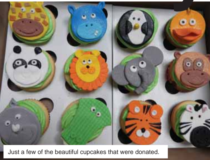
Just a few of the beautiful cupcakes that were donated.

Rustenburg – It was a festive celebration of colour on Saturday 29 September when Cupcakes of HOPE hosted its national Cupcake Day 4 Kids with Cancer at the Waterfall Mall's centre court. A variety of unique cupcakes to choose from, all made with love, was gobbled up by young and old. This event is a community driven project where volunteers 'bake' a difference in the lives of children with cancer by donating cupcakes. Their mission is to raise awareness of childhood cancer and funds for kids with cancer who need medical and financial assistance. Cupcakes of HOPE assist up to 70 cancer patients every month by donating financially towards their medical treatments or other day-to-day expenses like food, clothing and transport for hospital visits. The day was a huge success and every cupcake sold will make a difference in the lives of these kids. For more information or to join our awesome team of Cupcake Angels, please send an email to sandy@cupcakesofhope.org or visit www.cupcakesofhope.org .