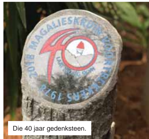
Die 40 jaar gedenksteen.

Magalieskruin het 40 jaar terug daar begin en is steeds sterk en volstoom aan die gang in Rustenburg. Tydens hul prysuitdeling op Maandag 29 Oktober het hulle 40 ballonne die lug ingelaat.