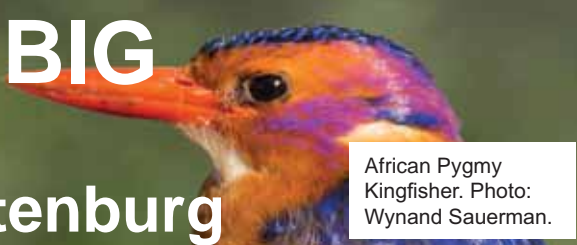
African Pygmy Kingfisher.

Rustenburg – The African continent is going big with this year's Birding Big Day (BBD) taking place Saturday 24 November. BirdLife South Africa will host their 34rd BBD.