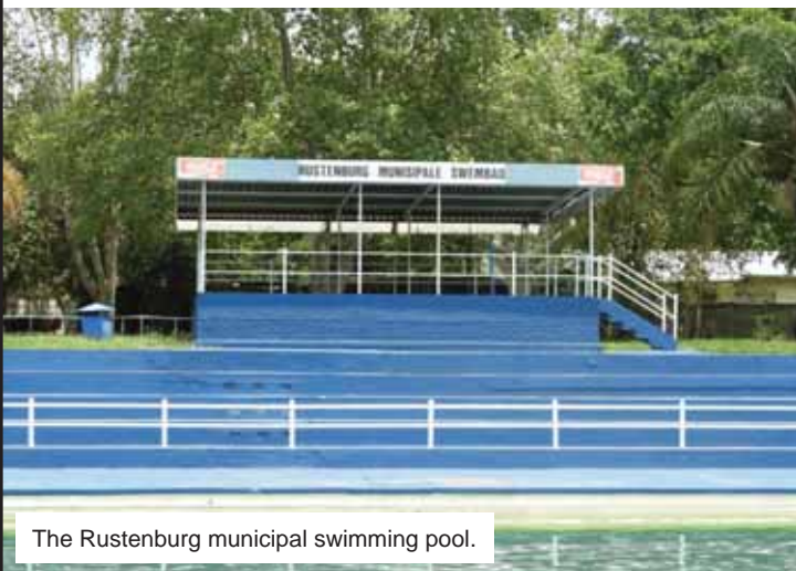
The Rustenburg municipal swimming pool.

Rustenburg – On Monday 19 November a man died in hospital after an incident at the Rustenburg municipal swimming pool the previous day. The community member who was rescued from the swimming pool, was admitted overnight for observation but later passed away. The Rustenburg Local Municipality has launched an investigation into the incident.