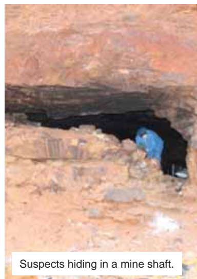
Suspects hiding in a mine shaft.