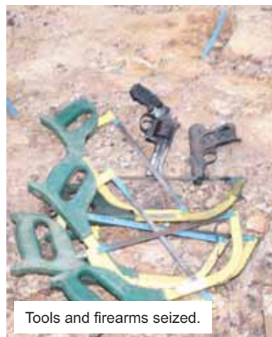
Tools and firearms seized.