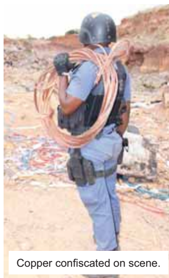
Copper confiscated on scene.