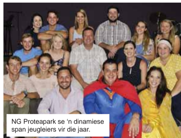
NG Proteapark se 'n dinamiese span jeugleiers vir die jaar.

Tydens die naweek het die belydenisgroep gaan kamp, in 'n heerlike en welkome manier mekaar leer ken, en intensiewe voorbereidingswerk gedoen vir die jaar wat voorlê. Hierdie groep jongmense skakel in by die kerk se uitreikaksies wat deur die jaar plaasvind. Inskrywings vir beide die jeug- en tienerbediening kan steeds hierdie week gedoen word.