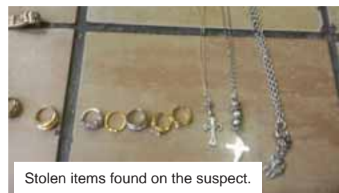
Stolen items found on the suspect.

Rustenburg – After following up on a tip, the Rustenburg's Crime intelligence personnel apprehended 30 year-old Sekwati Samuel Hlalele on suspicion of theft on 14 January. The investigation confirmed that an amount of R5 000 was withdrawn from the complainant's bank account at Boitekong Mall which led police to a tavern in Kanana where the suspect was arrested.