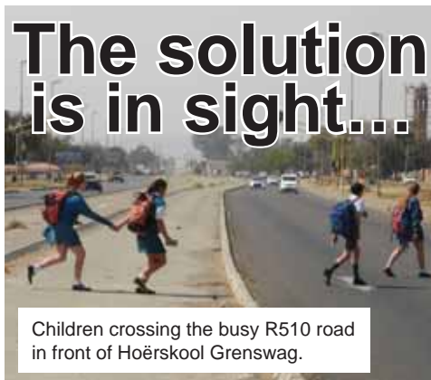
Children crossing the busy R510 road in front of Hoërskool Grenswag.