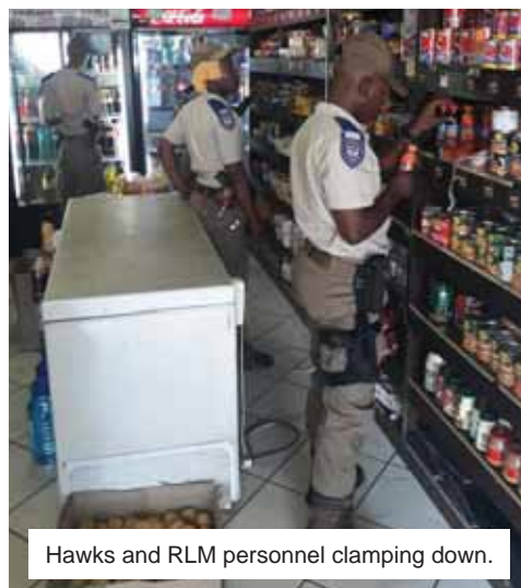
Hawks and RLM personnel clamping down.

Rustenburg – The Rustenburg Local Municipality (RLM) in partnership with the Hawks (Investigative Unit of the South African Police Service) on Monday 14 January embarked on a special operation, part of RLM's safe and clean city campaign. The raid focused on uprooting crime in the city involving scrap yards operating illegally and suspected of dealing in stolen copper cables and materials allegedly stolen from Eskom's infrastructure. The operation uncovered other illegal activities and practises inconsistent with the law, illegal trading in different business fields, including stores selling expired goods and food products. The municipality encourages the community to participate in the campaign by reporting criminal activities to the police.