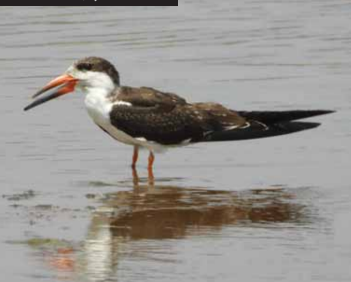
African Skimmer