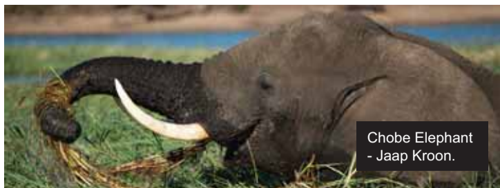
Chobe Elephant - Jaap Kroon.