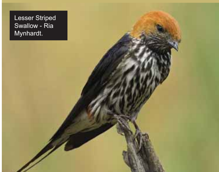
Lesser Striped Swallow

Rustenburg – The Rustenburg Photographic Society is an exciting and informative group of photographers living out their passion. Everyone from novice to professional photographers have the opportunity to learn and grow their craft.