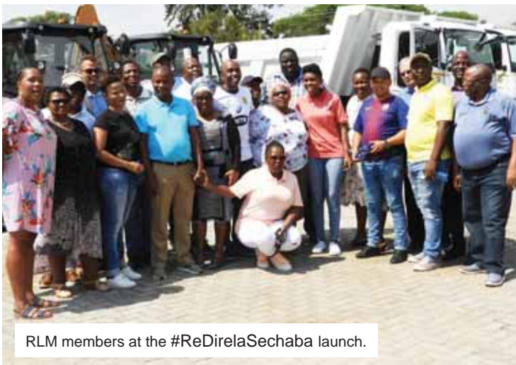
RLM members at the #ReDirelaSechaba launch.