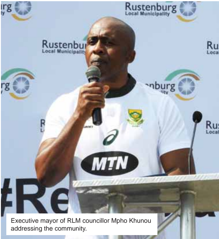
Executive mayor of RLM councillor Mpho Khunou addressing the community.