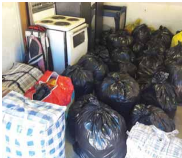
Donations for those affected by the cyclone are piling up, but much more is needed.