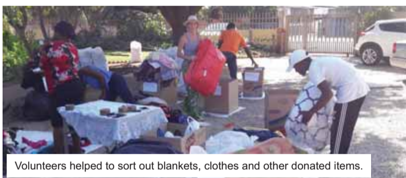
Volunteers helped to sort out blankets, clothes and other donated items.