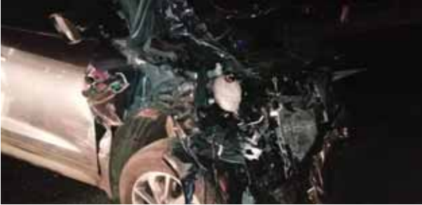
Two of the vehicles at the accident scene.

Find more cars at www.platinum-weekly.co.za Find more classifieds at www.platinumweekly.co.za Find